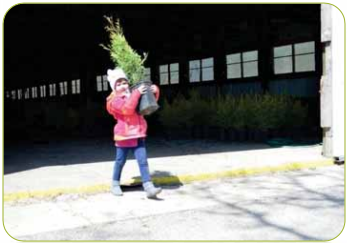
Get them interested in planting trees at an early age