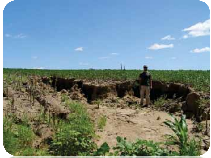
Gully erosion in need of stabilization