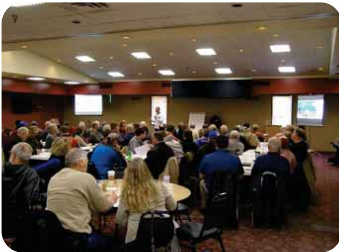
Soil Health informational meetings with local owner/operators