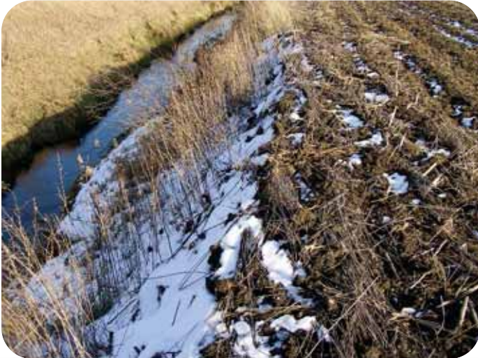
Example of an unbuffered ditch