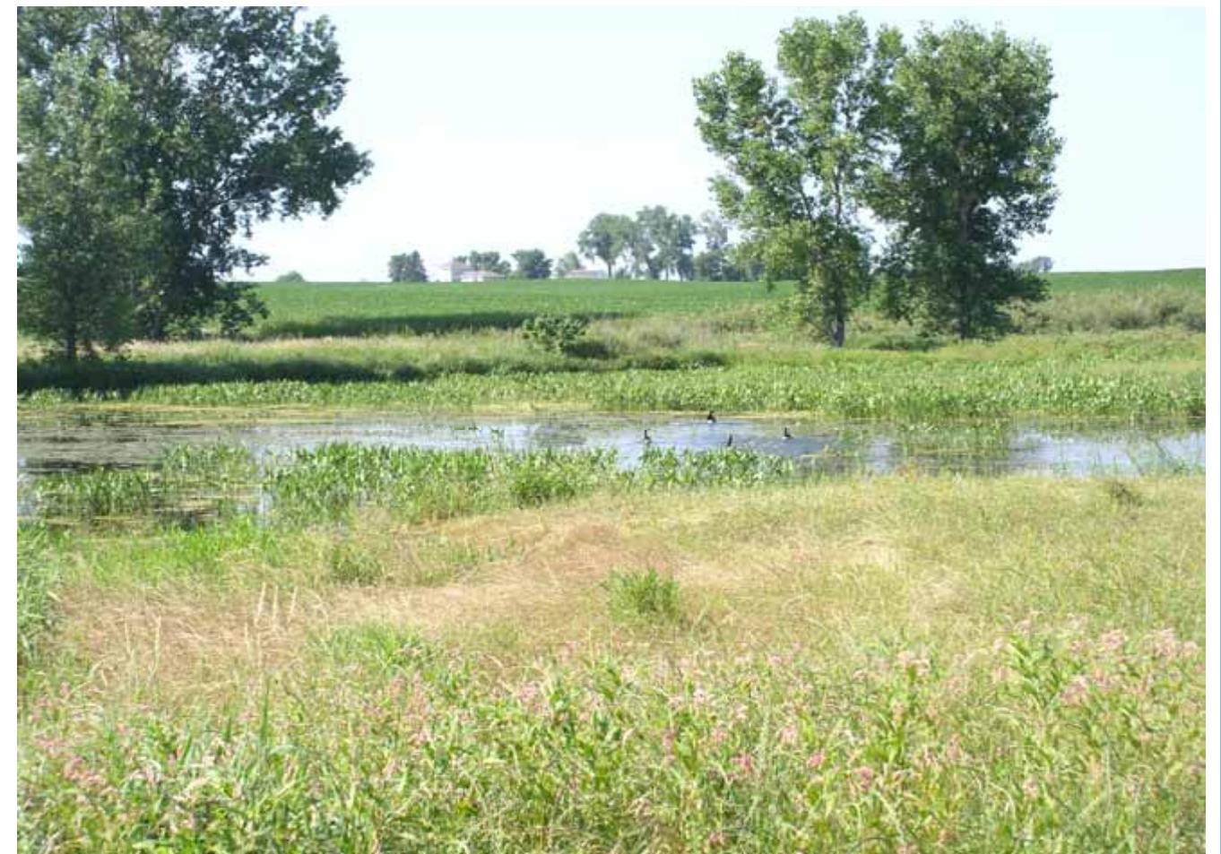
Geese enjoying a recent Wetland Restoration/Enhancement Project