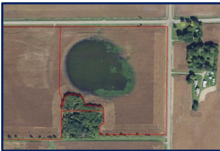
Landowners with marginal cropland can apply for the MN Conservation Reserve Enhancement Program (CREP)