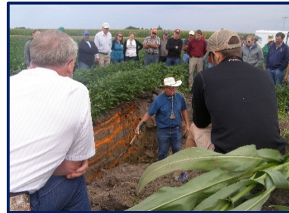
Soil Health Field Day – learning how soil, water, worms, and plants interact