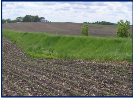
Water & Sediment Control Basin funded with SWCD cost share funds